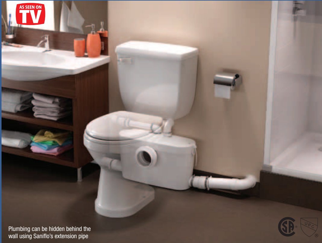
Plumbing can be hidden behind the wall using Saniflo's extension pipe

Install a complete bathroom anywhere you need!